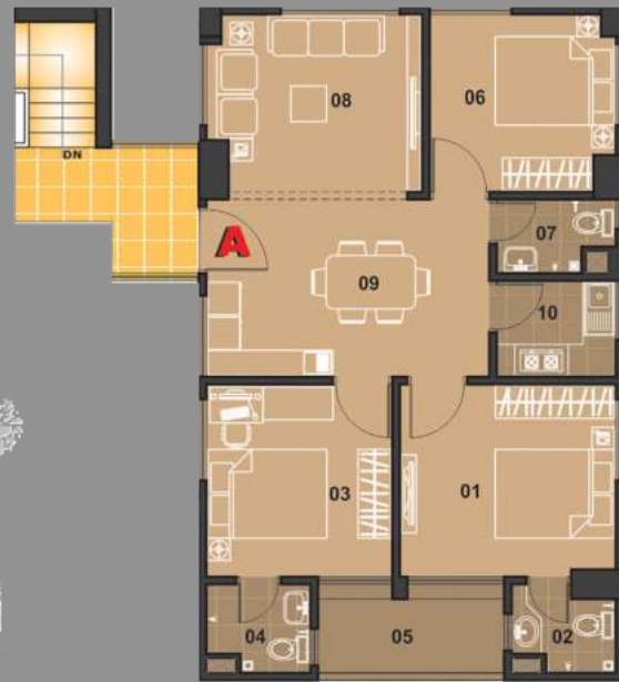
typical floor plan