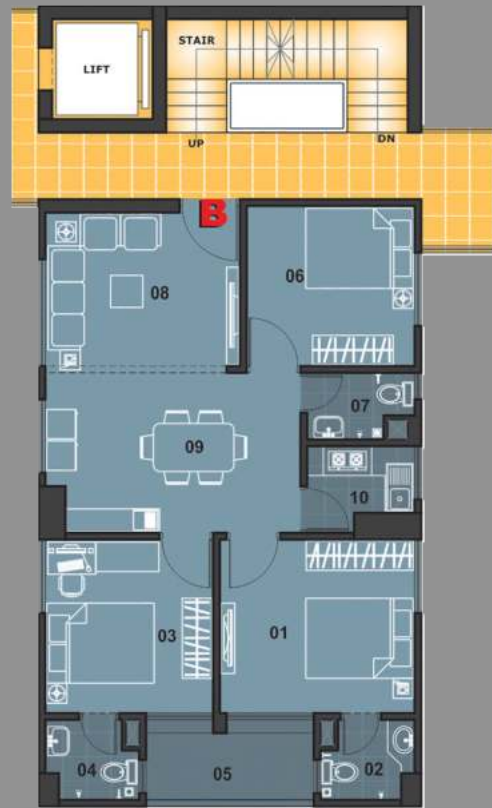
typical floor plan