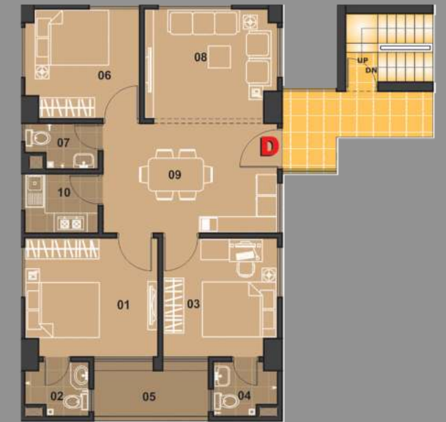
typical floor plan