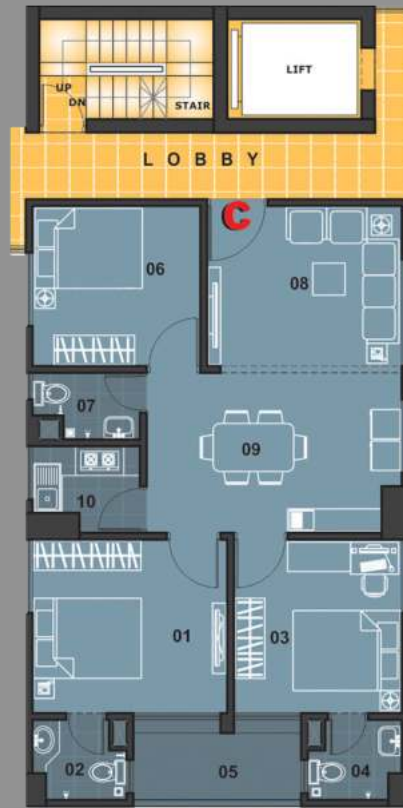
typical floor plan